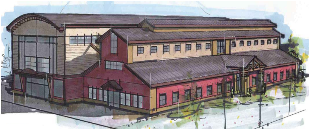
Potential redevelopment rendering